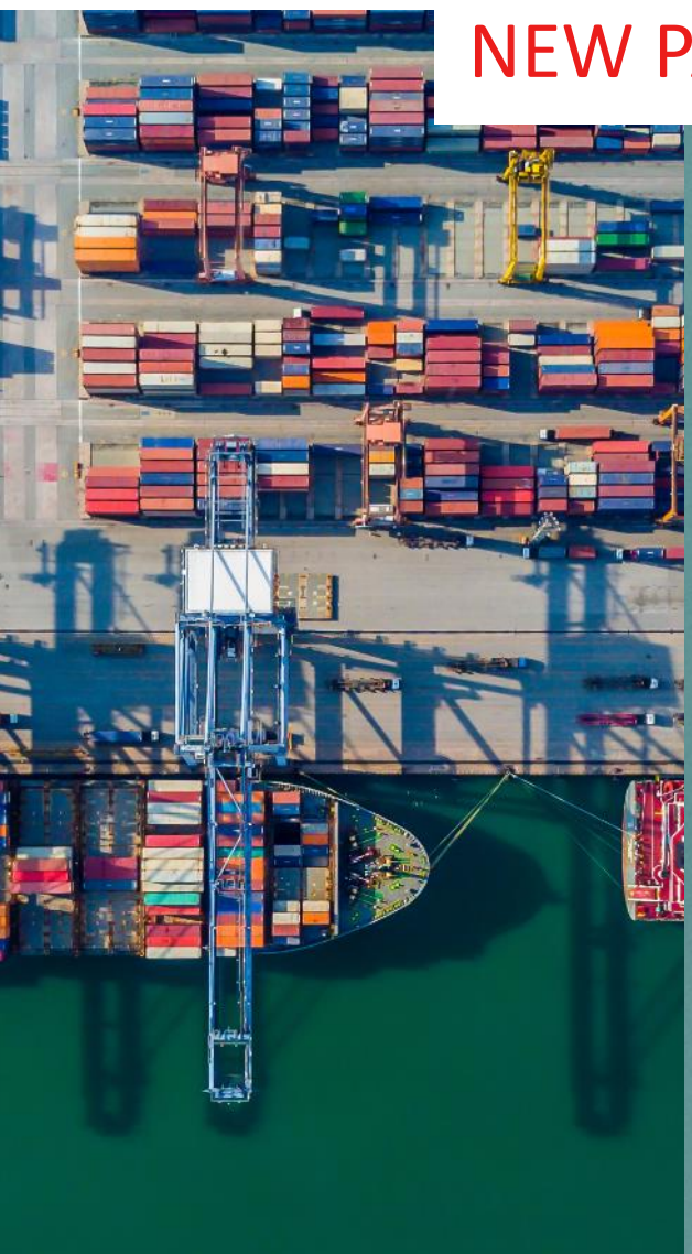
INFRASTRUCTURE IN AFRICA – A. P. MØLLER HOLDING