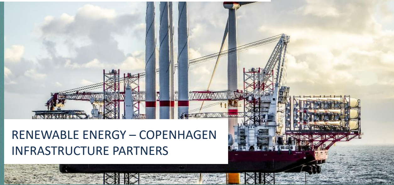
RENEWABLE ENERGY – COPENHAGEN INFRASTRUCTURE PARTNERS