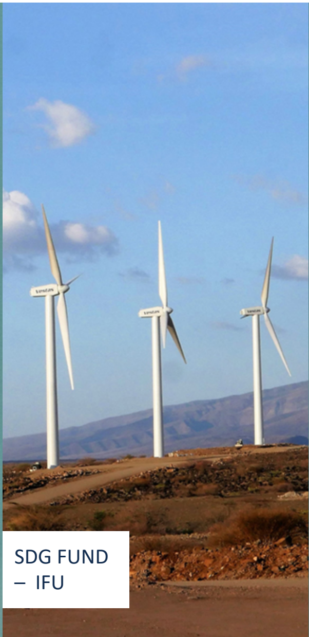
SDG FUND – IFU