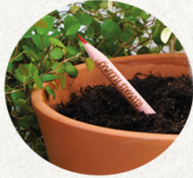
2. Plant it