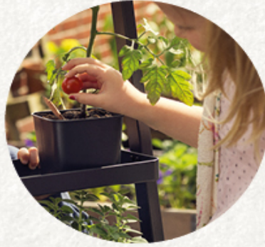
3. Plants will sprout

All our pencils have seeds attached and there is a variety of different seeds to choose from.